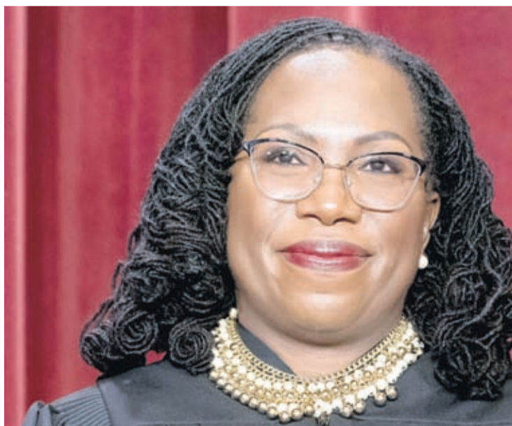
Associate Justice Ketanji Brown Jackson stands as she and members of the Supreme Court pose for a new group portrait following her addition, at the Supreme Court building in Washington, Oct. 7, 2022.